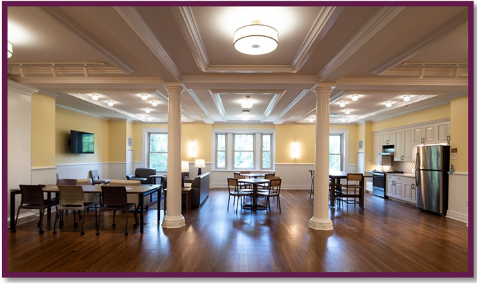
Rebekah Hall – Residence floor common space