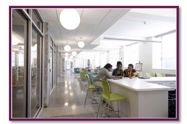
Campbell Hall - Ground floor common area

sink, full size refrigerator, microwave, couch, common computer, and a high definition cable television. Several academic resources can also be found in Campbell Hall on the ground floor, including the Center for Writing and Speaking, Economics Learning Center, Sociology and Anthropology Research Lab, and the Resource Center for Math and Science. Campbell Hall is fully staffed with a Graduate Assistant and three Resident Assistants.