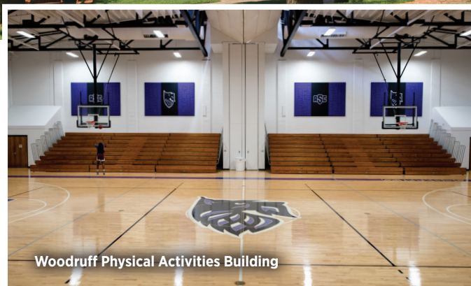
Woodruff Physical Activities Building

Campus architecture includes 30 beautiful collegiate Gothic and Victorian red brick-and-stone buildings. Among these are our award-winning observatory, traditional and contemporary lecture halls and auditoriums, library, dining hall, John Portman-designed art gallery, bell tower, chapel and athletic facilities.