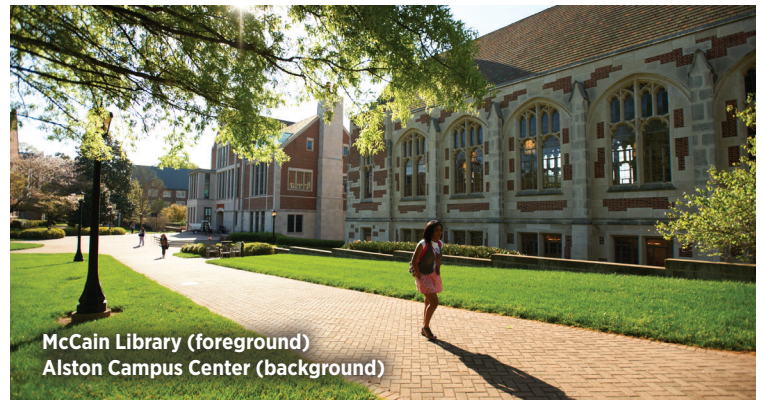
McCain Library (foreground) Alston Campus Center (background)