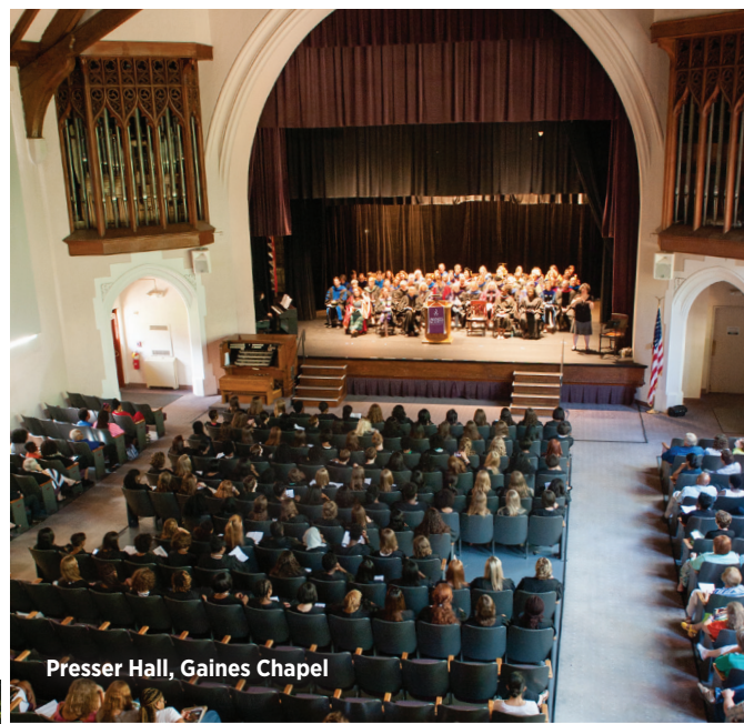
Presser Hall, Gaines Chapel

We're an experienced production location. Our film-friendly campus is centrally located, compact and logistically accessible. The campus has ample parking space for production crews and actors. We also have on-campus staging areas for base camps and parking for full-size semi trucks.